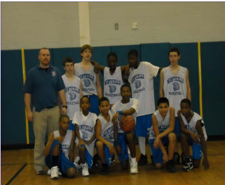
Boys' Modified Basketball Team members and their coach look cool for posterity.