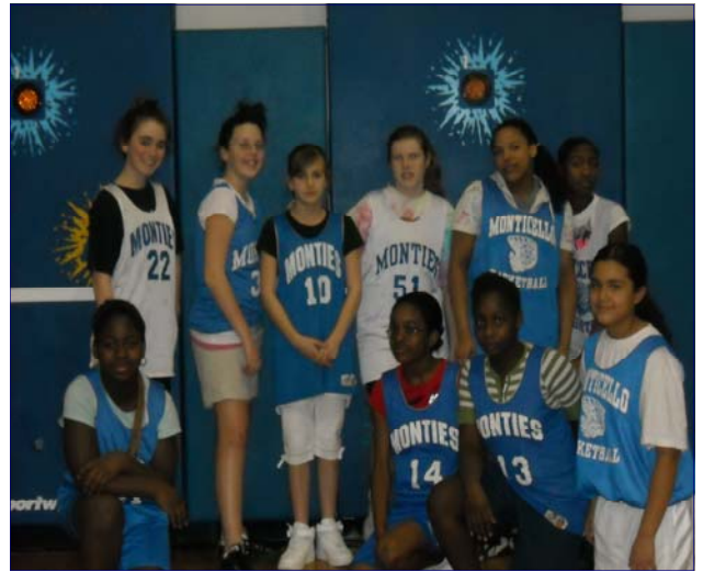
Spunky Girls' Modified Basketball Team members strike a pose for the camera.