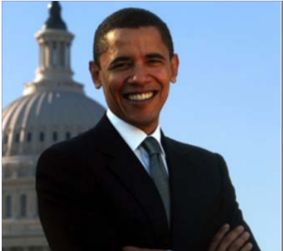
President Barack Obama