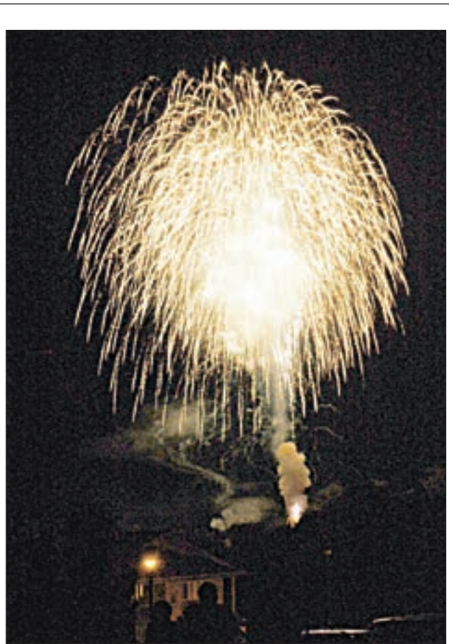
DAN HUST | DEMOCRAT

The Villa Roma Resort Hotel, nestled in the hills between Jeffersonville and Callicoon, will have many prime viewing spots for its Independence Day fireworks show. Try out County Route 164, Villa Roma Road, Beechwoods Road, Reum Road, Bauernfeind Road, Radio Tower Road, Katz Road, Tonjes Road or Polster Road.